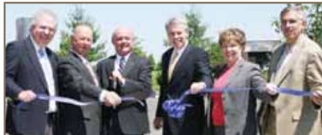
Mercy Health Plans recently celebrated the grand opening of a new location in Springfield, Mo.

Mercy Health Plans recently celebrated the grand opening of a new location in Springfield, Mo. The new two-story, 42,500-square-foot building will house approximately 150 co-workers and support