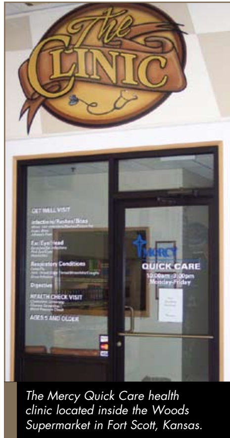
The Mercy Quick Care health clinic located inside the Woods Supermarket in Fort Scott, Kansas.

M ercy Health Center in Fort Scott, Kansas, recently teamed up with a local supermarket to open Mercy Quick Care, a health clinic located inside the Woods Supermarket in Fort Scott. The clinic, which is staffed by nurse practitioners, sees patients with minor health concerns and offers screenings for well individuals. •