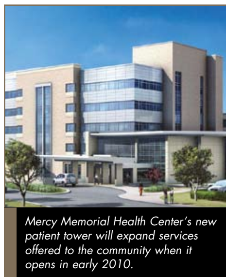
Mercy Memorial Health Center's new patient tower will expand services offered to the community when it opens in early 2010.

M ercy Memorial Health Center in Ardmore, Oklahoma, recently broke ground on a $60 million patient tower. The tower will house 158 private rooms, a women's health center, an improved intensive care unit, new entrance and additional parking. Construction is expected to be complete in February 2010. •