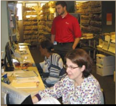
"Red Shirt" experts guide co-workers at a Crestwood, Missouri, physician office through their first day of using the Epic electronic health record system.

M ercy has successfully launched the Epic electronic health record (EHR) system at physician offices in Northwest Arkansas and Springfield, St. Louis and Washington, Missouri. Practice management applications are used to register patients and add documents such as consent forms and insurance-related information into patients' electronic records. Clinical applications are used to document patient care, place orders and begin building a consolidated electronic health record for each patient. Additional Mercy physician offices across the System will go live on the Epic system later this year and in early 2009. •