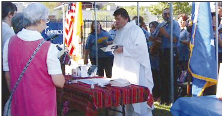
Mercy Ministries of Laredo co-workers and patients celebrate a Mercy Day Mass on the grounds of the Primary Healthcare Clinic.

The week-long celebration officially began on September 24 with a special mass for co-workers and individuals served by Mercy Ministries of Laredo. The date coincided with Mercy Day, the anniversary of the opening of the first House of Mercy in Dublin, Ireland, by Sisters of Mercy foundress Catherine McAuley. Another