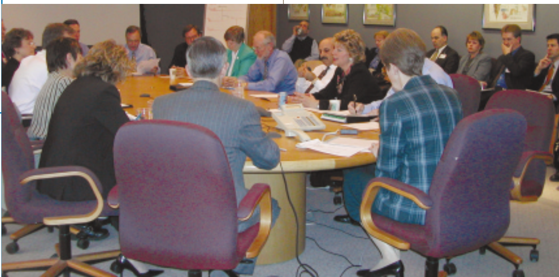
The Genesis Project Steering Committee meets regularly to provide project oversight and direction. Committee members include representatives from Mercy's Strategic Service Units as well as physicians and other Mercy leaders.

address these challenges by redesigning core clinical and business work processes used throughout the System, and then enabling information technology to support these processes.