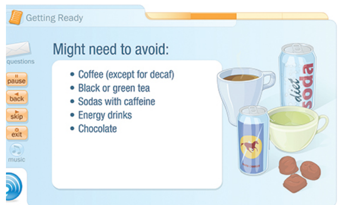
© 2014 Emmi Solutions, LLC. Sleep Study program