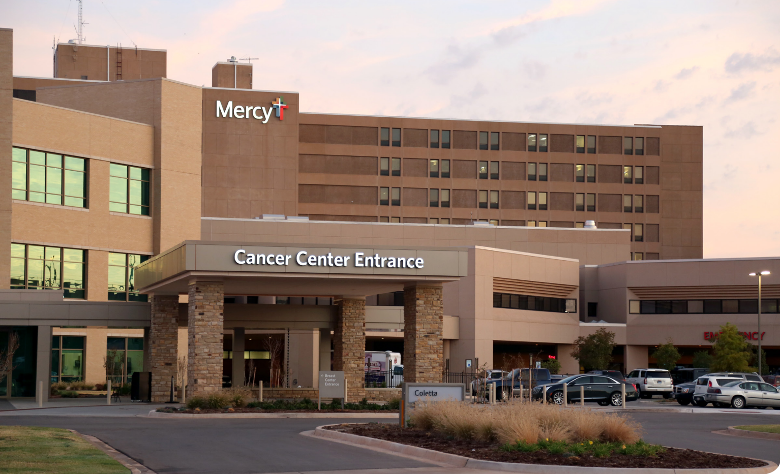
The Coletta Building opened June 22, 2016. It is the first cancer treatment facility in Oklahoma City to be designed with the input of patients and their families.